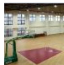
Indoor Pvc Sport Flooring